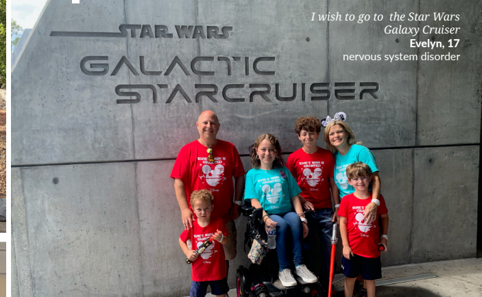
I wish to go to the Star Wars Galaxy Cruiser Evelyn, 17 nervous system disorder