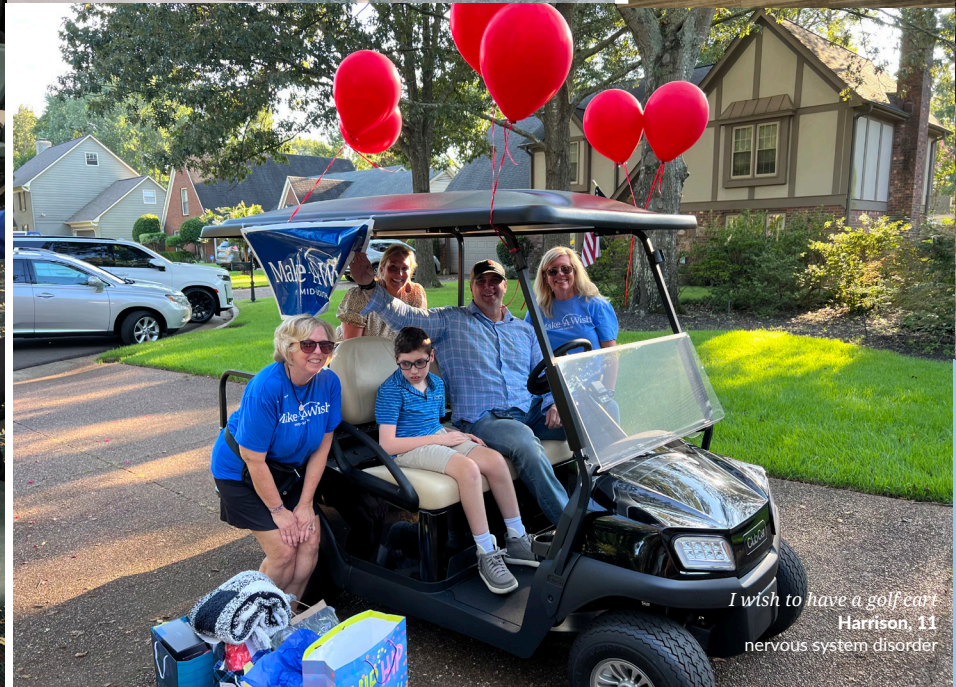
I wish to have a golf cart Harrison, 11 nervous system disorder