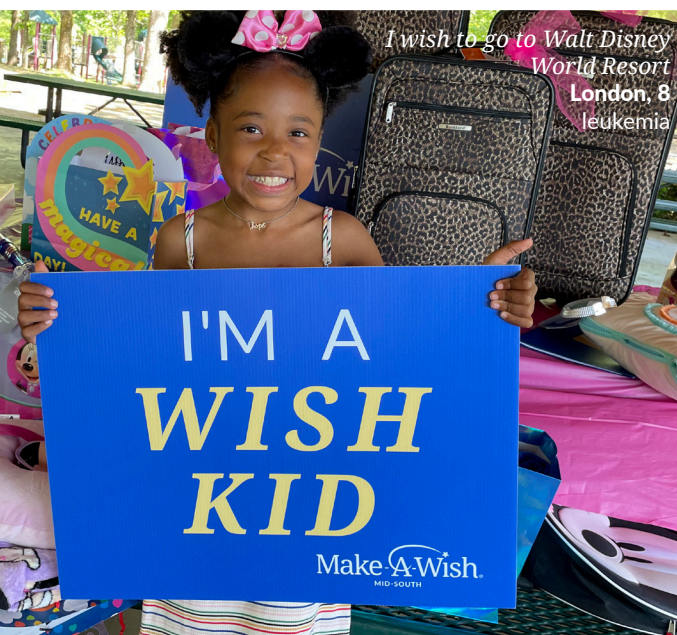
I wish to go to Walt Disney World Resort London, 8 leukemia