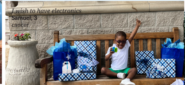
I wish to have electronics Samuel, 3 cancer